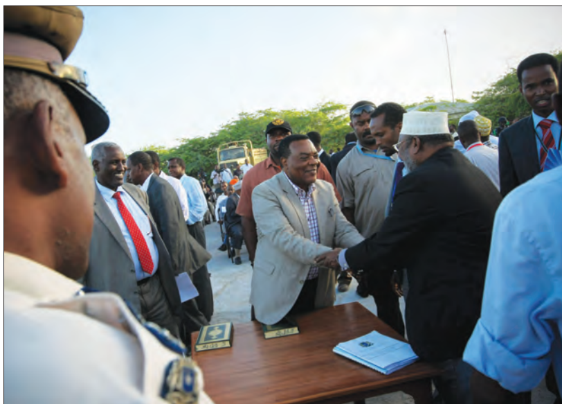
Augustine Mahiga (center), Special Representative of the UN Secretary-General and head of the UN Political Office in Somalia (UNPOS), greets a Somali official, ahead of the swearing-in ceremony for members of the New Federal Parliament of Somalia, 20 August 2012.

On 7 November, 5 the Security Council reauthorized AMISOM until 7 March 2013 to maintain its presence in the areas set out in its January strategic concept in order to establish secure conditions for legitimate governance, reconciliation, and the provision of humanitarian assistance across Somalia. The Council also extended the logistical support package to an additional fifty civilian personnel. Following an AU request, the Council underlined the importance of swiftly deploying the civilian staff to areas recently liberated from al-Shabaab.