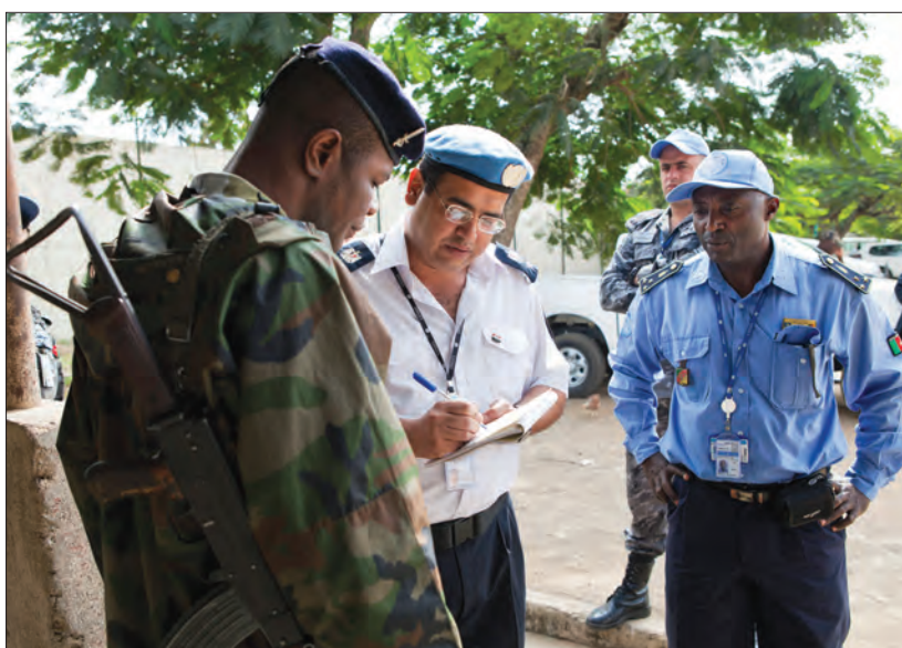
Police stationed with the UN Operation in Côte d'Ivoire (UNOCI) coordinate with the gendarmerie in the La Maison de'Arrete et Correction prison in Abidjan, following attacks on the Youpougou and Akouedo camps.